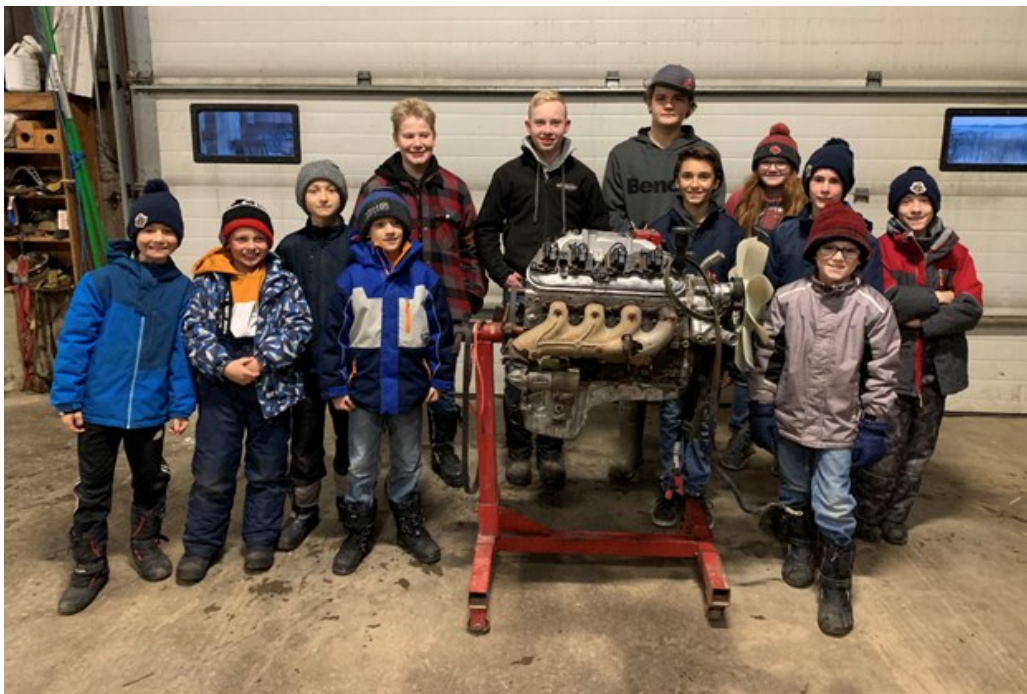
4-H Multi-Club Small Engines Members Early Nov 2020