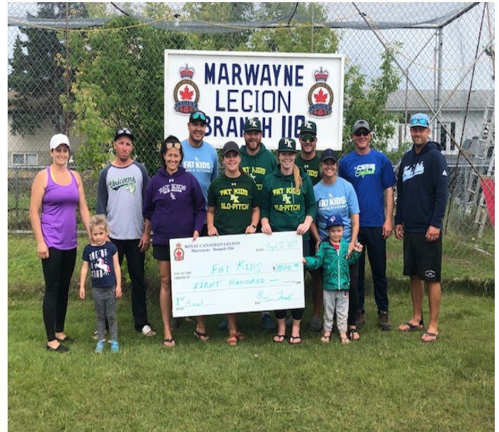
A Final Winners: Fat Kids