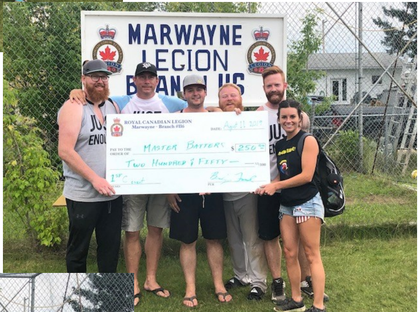
MASTER BATTERS—1ST “C” EVENT