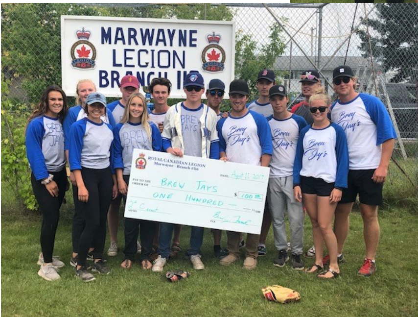
BREW JAYS—2ND “C” EVENT