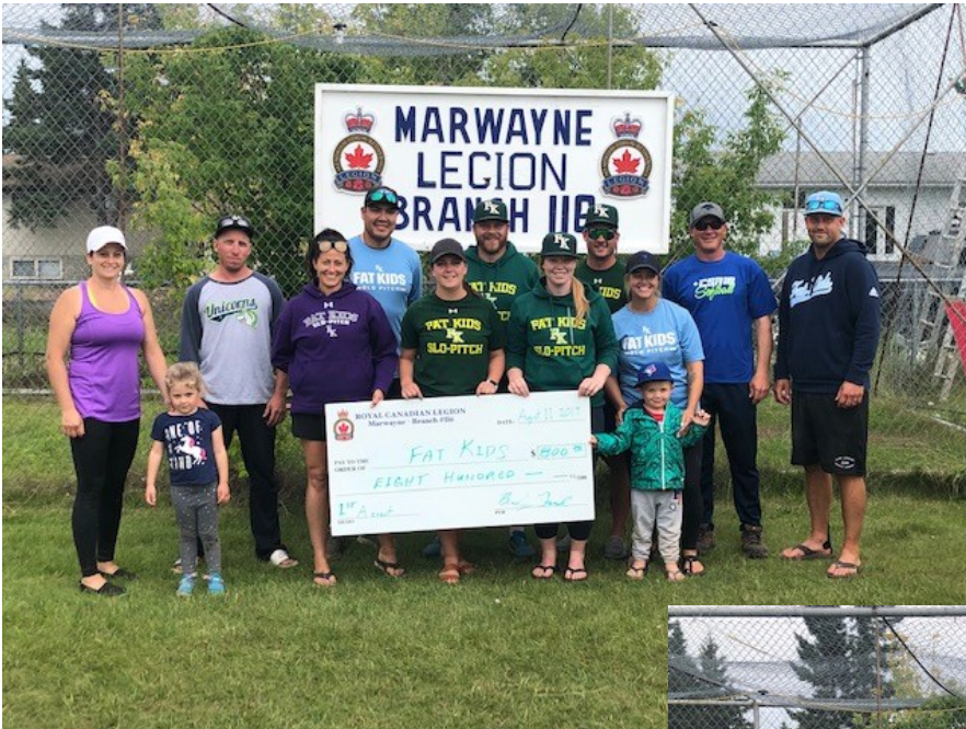
FAT KIDS—1ST “A” EVENT