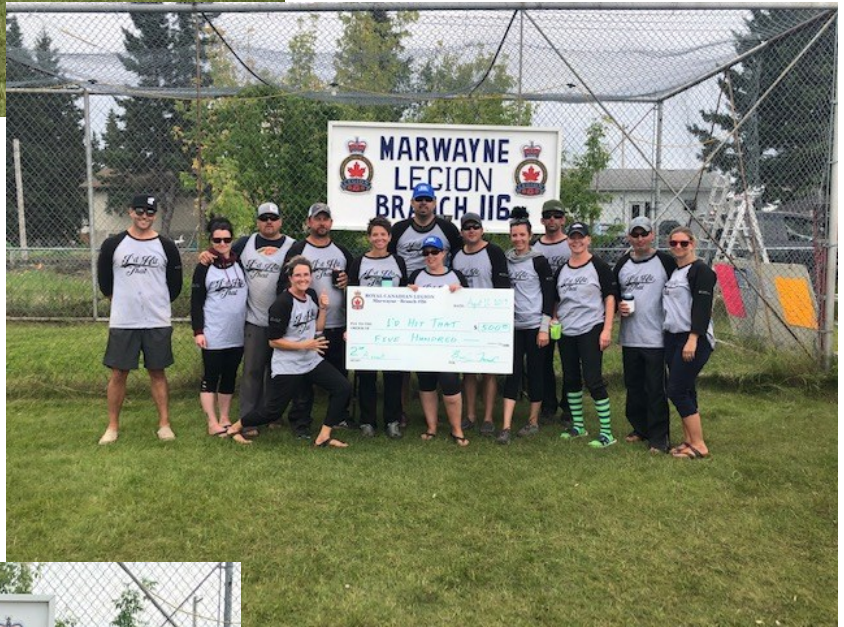
I'D HIT THAT—2ND “A” EVENT