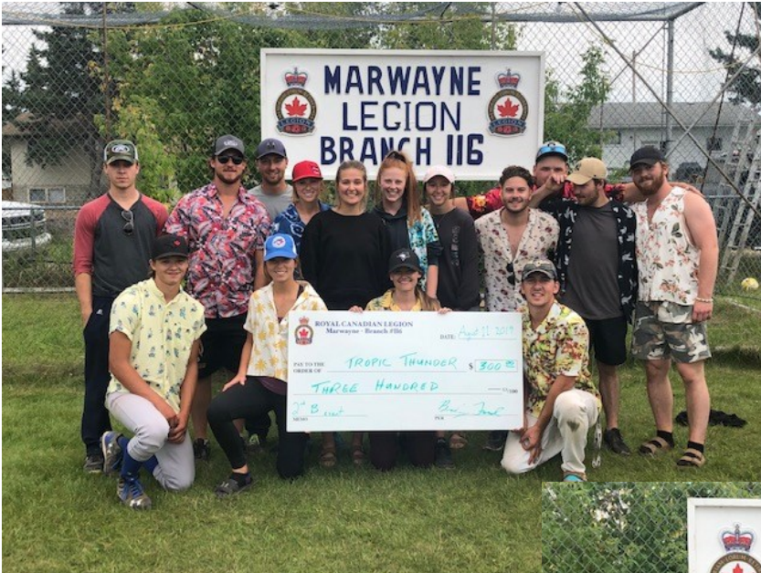
TROPIC THUNDER—2ND “B” EVENT