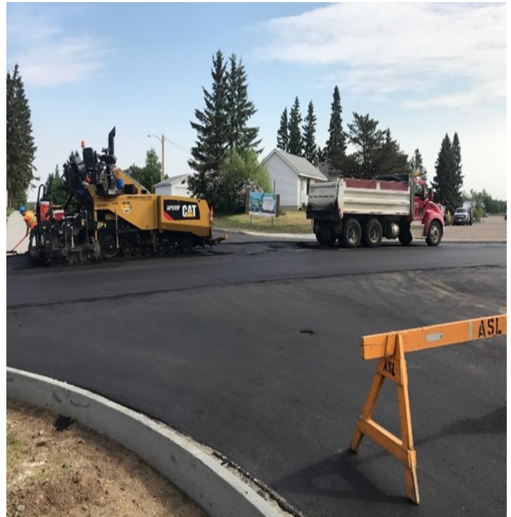
North Second Avenue

The Village's Public Works department utilized the services of the contractors while they were in town to repair sections of damaged sidewalks and patch faults in the roads caused from underground repairs.