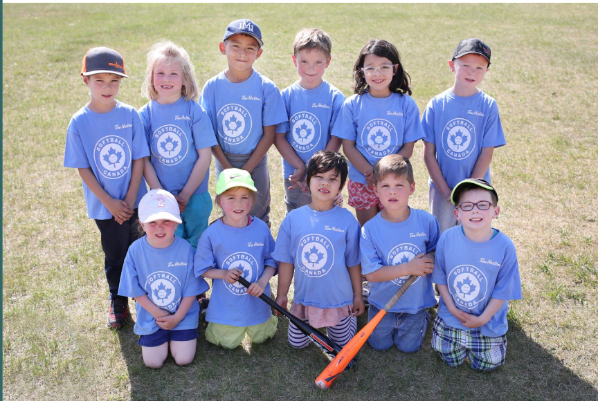
LEARN TO PLAY